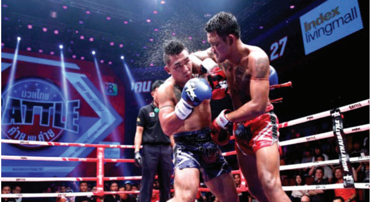
Muay Thai boxing in action

The game of Muay Thai gained its popularity towards 1930s and revived under the Marquess of Queensberry rule with modernized regulations. It gradually spread towards the western world of boxing in the name of kickboxing. Since then, several standard Thai boxers have won the world boxing championships. In 1996, a Thai featherweight boxer SomluckKamsing earned the country's first Olympic Gold Medal and in 1999, boxer Khaosai Galaxy was inducted into the International Boxing Hall of Fame.