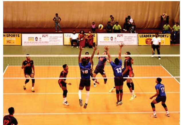
Game of volleyball in progress

One of the reasons for changing their national sport from Elle to Volleyball, I believe was in light of the difficulties in gaining popularity of the sport ‘Elle’ beyond Sri Lanka or at the international arena to be specific.